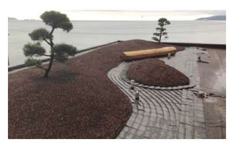
Square-shaped slabs form the walkways on the roof surface.