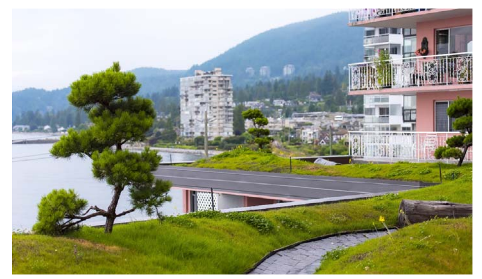
The residents of the apartments can let their eyes wander over a sophisticated roof landscape now.