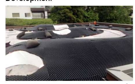
The planting areas were equipped with Floradrain® FD 40-E-elements while Floradrain® FD 60 was used as a base for the tree planters.