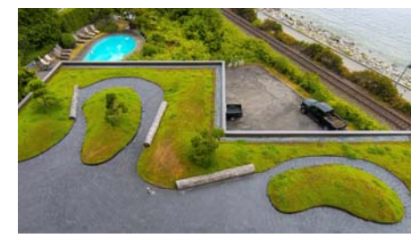
Features like topiaries and tree trunks provide accents on the roof. The illumination behind the angle profiles is visible only in the dark.

Roof construction with root resistant waterproofing