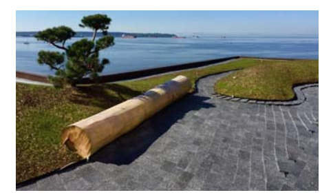
The walking areas were edged with angle profiles; Tree trunks serve as design elements.